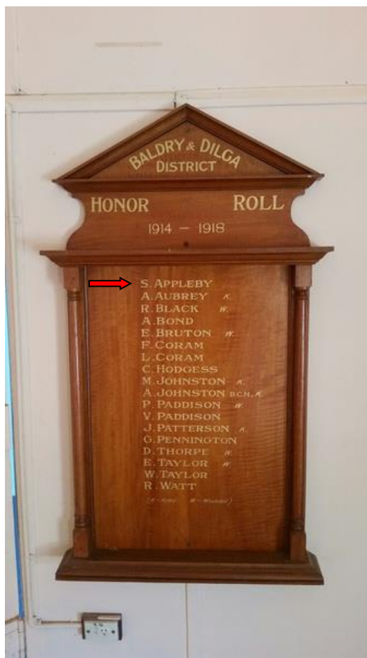
Baldry & Dilga District Honor Roll