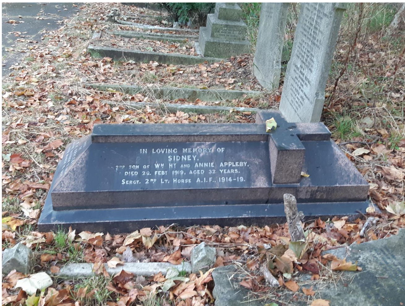
Photo of Lance Sergeant Sidney Appleby's Private Memorial in Brockley Cemetery, London, England.