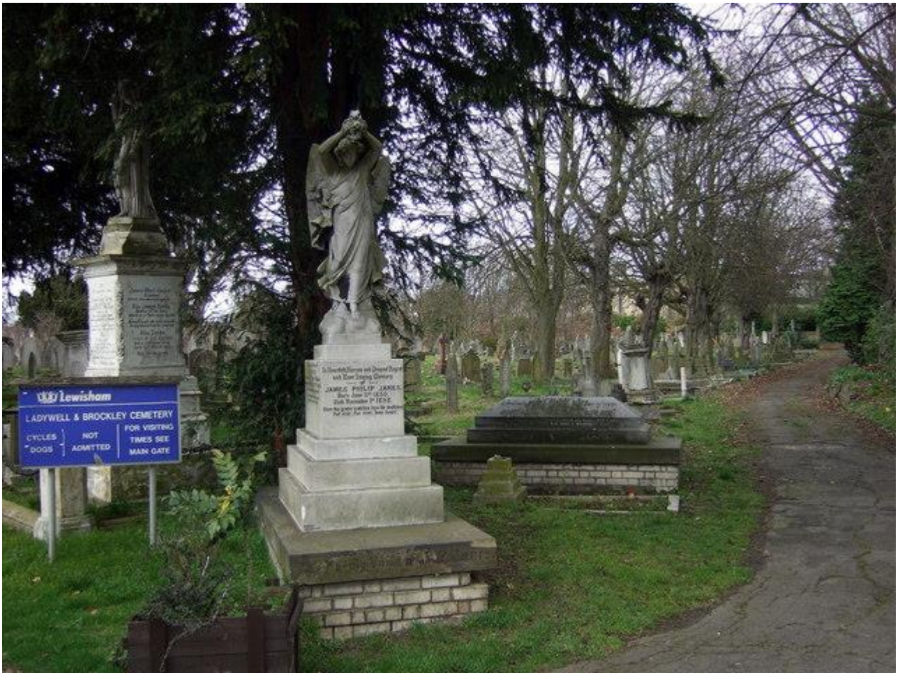
Ladywell and Brockley Cemetery